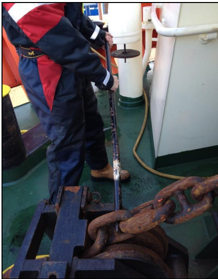
Pinch bar used to rotate anchor chain